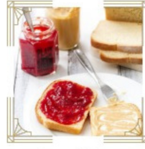
Bread & Jam