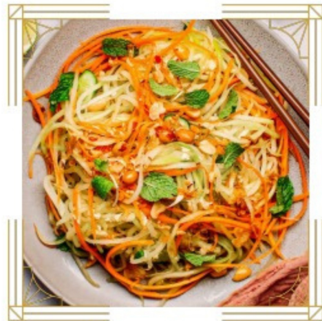
Som Tum Papaya Salad