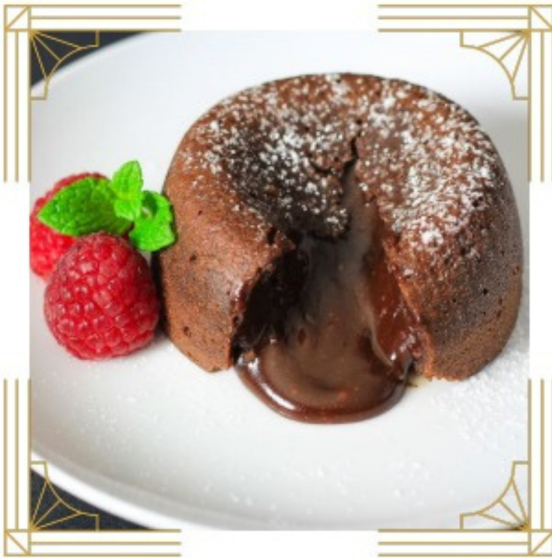
Chocolate Lava Cake