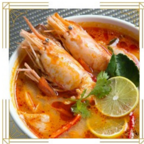
Tom Yum Thai Spicy & sour Soup with Thai herb