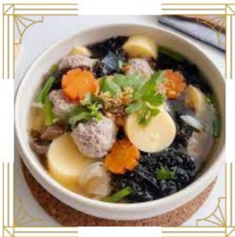
Kang jued Sarai Tofu kai Clear soup with Chinese cabbage, seaweed and tofu