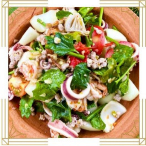
Yum Talay Spicy seafood Salad