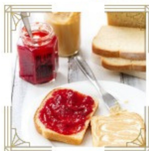
Bread & Jam