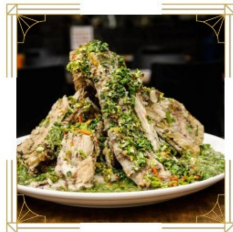
Tom Leng Spicy Pork Back-Bone Stew