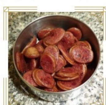
Chinese Pork sausage