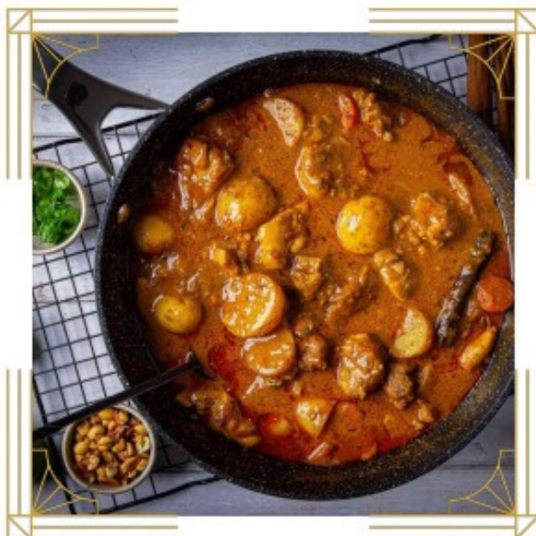
Massaman curry beef or chicken mussaman curry