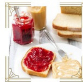
Bread & Jam