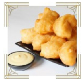
Deep-fried dough stick