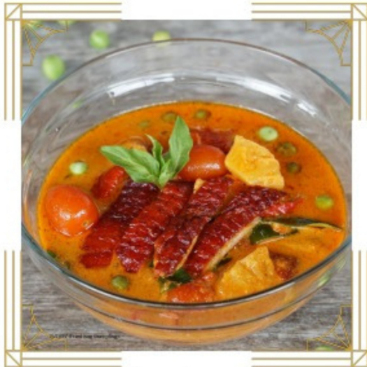
Kang Phed ped yang Roast Duck Red Curry