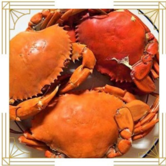
Steamed Seafood Choice of Shell , Fish, Crab or shrimp