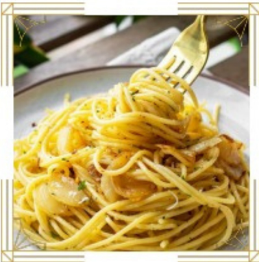
Spaghetti Aglio e Olio