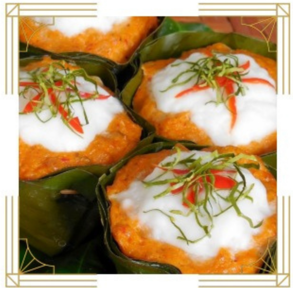
Hor Mok Steamed fish in coconut shell with coconut milk and flavoured with curry paste