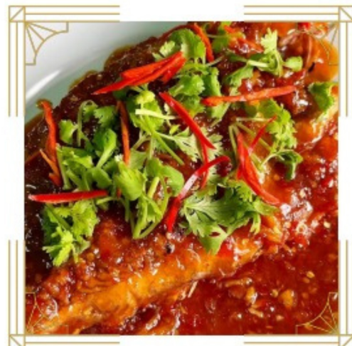
Pla Radd Prik Deep Fried Fish And Chili Sauce