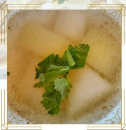
Clear Gourd Soup