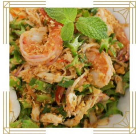
Yum Thua Plu Winged Bean Salad