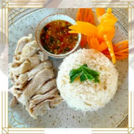
Steamed rice topped with chicken