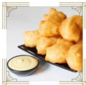
Deep-fried dough stick