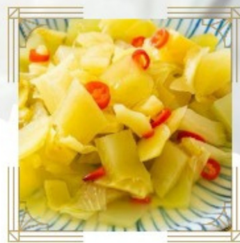
Spicy pickle cabbage salad