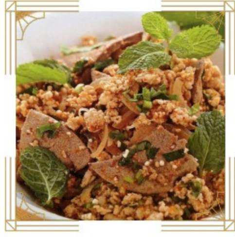
Larb spicy minced Chicken /Pork salad