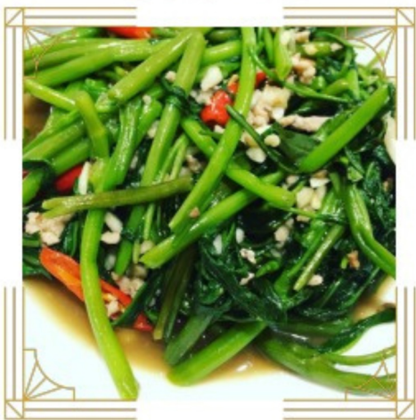
Pad Pak Bung Fai Dang Stir-Fried Chinese Morning Glory