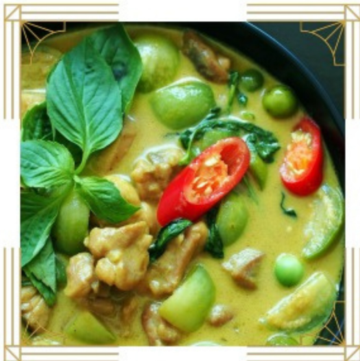
Kang keaw waan Thai green curry with chicken