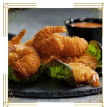
Deep fried wrapped shrimps with noodle