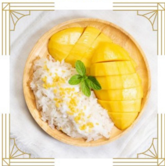
Mango Sticky Rice