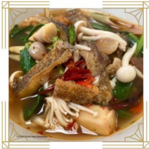
Tom Klong Sour And Spicy Smoked Dry Fish Soup