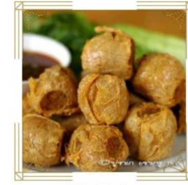
(Hoi Jo) Deep Fried Crab Meat Rolls