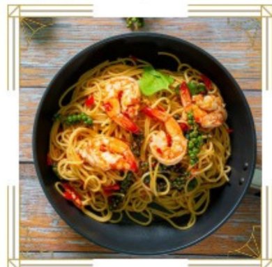
Stir-fried Seafood, Chicken, Pork with Basil and Chilli Pasta