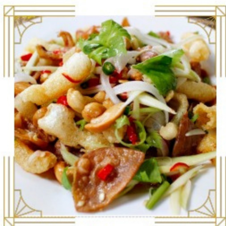
Yum Sam Grob Thai Crisp Salad