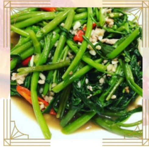
Stir-Fried Chinese Morning Glory