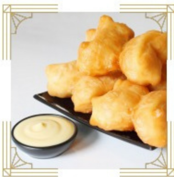
Deep-fried dough stick