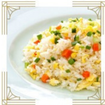
Eggs Fried rice