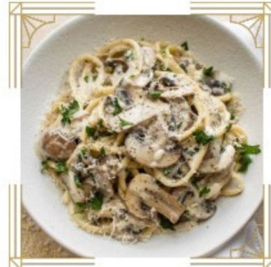
Mushroom Cream Sauce