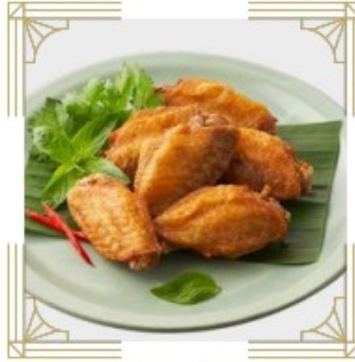
Crispy Fried Chicken