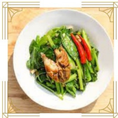
Ka Na Pla Khem Stir fried chinese kale with salted fish