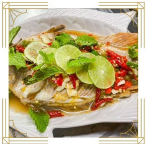
Nueng Manow Steamed fish with lime ,garlic and chilli