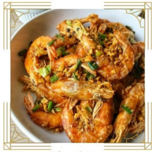
Kung Thod Kra Taim Crispy Fried Shrimps with Garlic