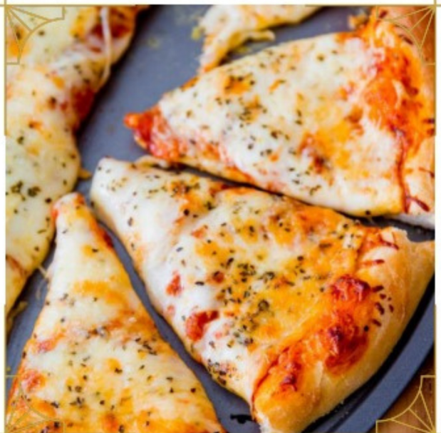
Triple Cheese Pizza