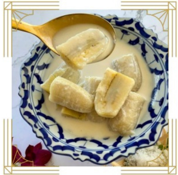
Banana in coconut milk