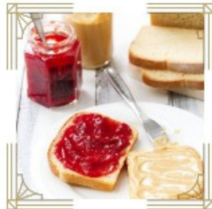
Bread & Jam