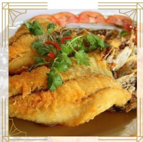
Pla Thod Nam Pla Deep-fried Sea bass with Fish Sauce