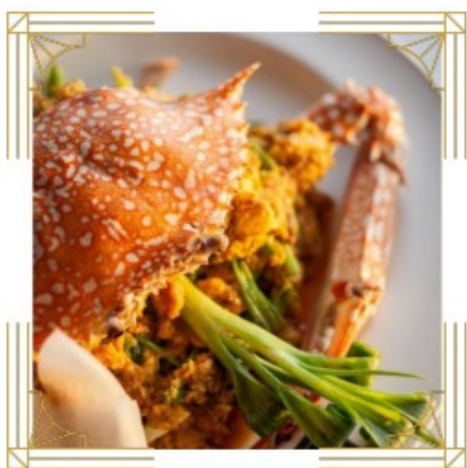
Pu Pad Pang Kra Ree Stir-fried crab with curry powder