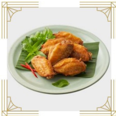
Kai Thod Crispy Fried Chicken