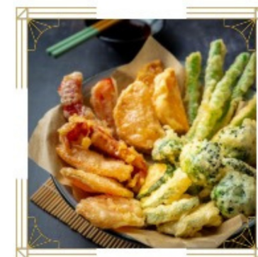
Deep Fried vegetables