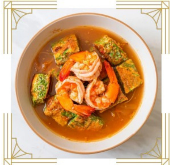
Kang som cha om thod Sour Curry with Vegetable Omelet