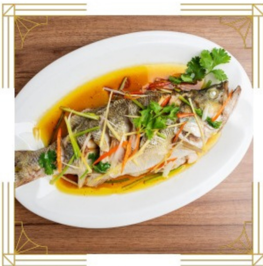
Nueng See-iew Steamed fish with soy sauce and ginger