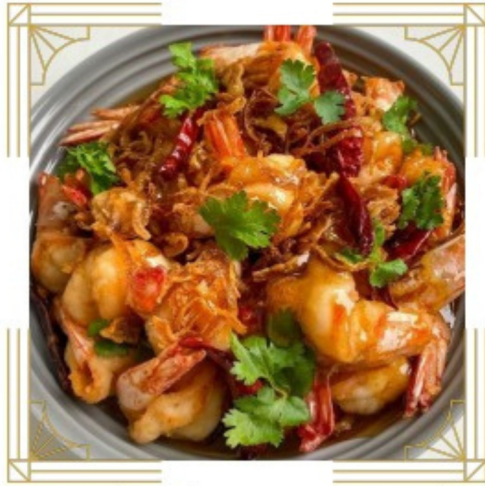
Kung Thod Sauce Ma Kham Crispy Prawn in Tamarind Glaze