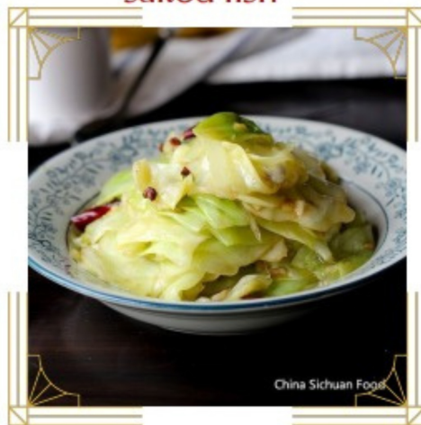
Pad Kra Lum Pli Stir-fried cabbage