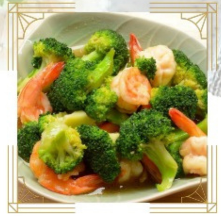
Stir fried broccoli with shrimp