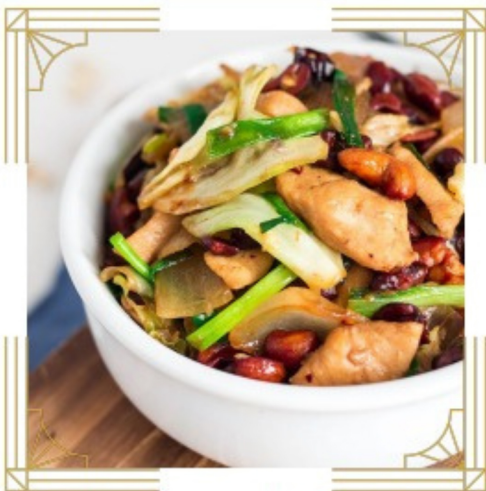
Kai Phad Med Ma Muang Stir-fried chicken with cashew nut