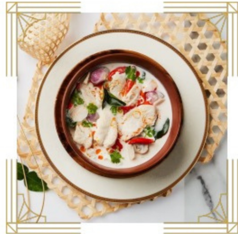
Tom Kha Thai Chicken Coconut Soup