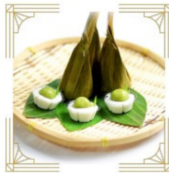
Thai Desserts (Can choose the type of Desserts)