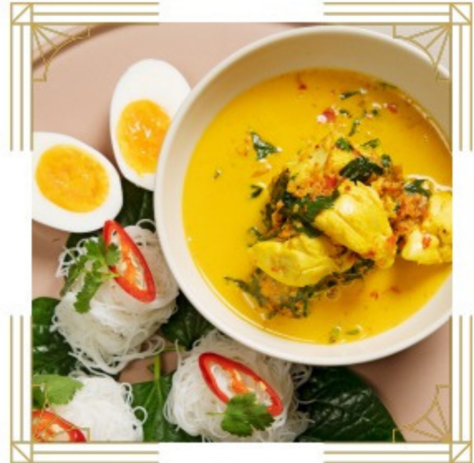
Kang pu Bai cha phu Crab and Betel Leaf Curry