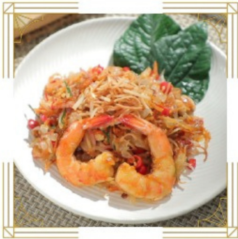
Yum Som-O Kung Thod Pomelo Salad in Crisp Tartlets